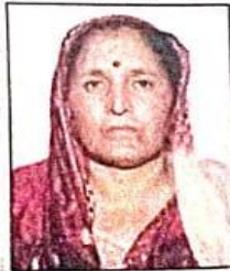
ससद इन्द्रा देवी