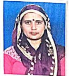
ससद जॉनी देवी